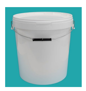
33 litre Bucket with Plastic or Metal Handle & T/E Lid