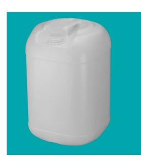
25L U.N. Jerrycan 950g