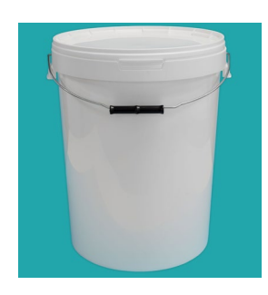
25 litre Bucket with Metal Handle & T/E Lid