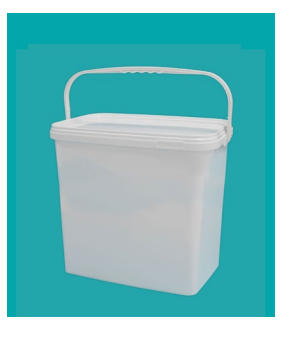
10 litre Tall Bucket with Plastic Handle & T/E Lid

White: MPGTRN10000PBW Clear: MPGTRN10000PBC