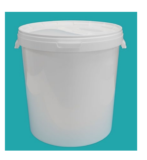
33 litre Bucket (no handle) & T/E Lid