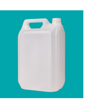
5 litre Jerrycan (125g)