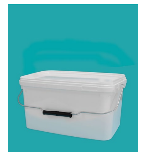
10 litre Squat Bucket with Metal Handle & T/E Lid