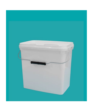
10 litre Tall Bucket with Metal Handle & T/E Lid