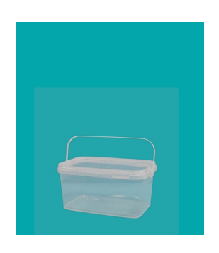
2.5 litre Bucket with Plastic Handle & T/E Lid

White: MPGTFR2500PBW Clear: MPGTFR2500PBC