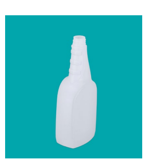
750ml Trigger Bottle