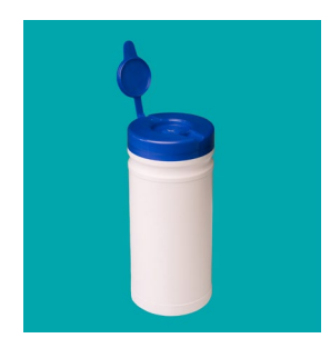
2 litre Wipes Pack