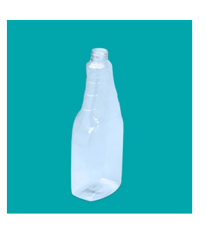
750ml Trigger Bottle