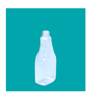
500ml Trigger Bottle