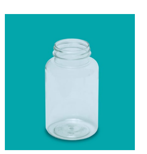
275ml PET Bottle