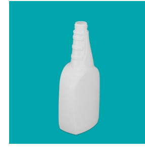
750ml Trigger Bottle