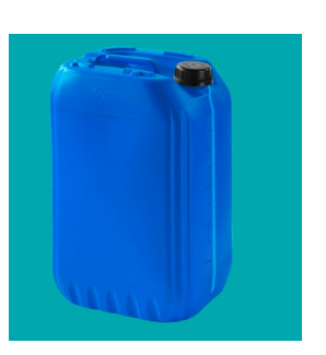
25 litre U.N. Heavy-Duty