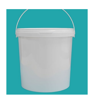
20 litre Bucket with Plastic & T/E Lid

White with plastic handle: MPGTF20000PBW