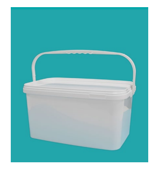
10 litre Squat Bucket with Plastic Handle & T/E Lid

White with plastic handle: MPGTFR10000PBW