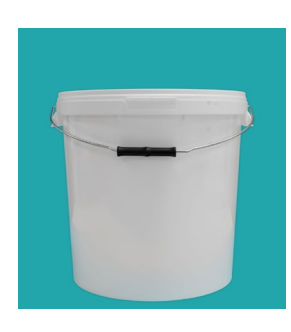
20 litre Bucket with Metal Handle & T/E Lid