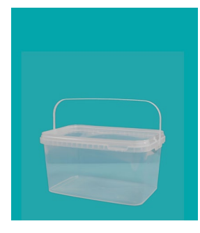
5 litre Bucket with Plastic Handle & T/E Lid

109.5 (inc handle) + 38 = 147.5g \pm 5\%