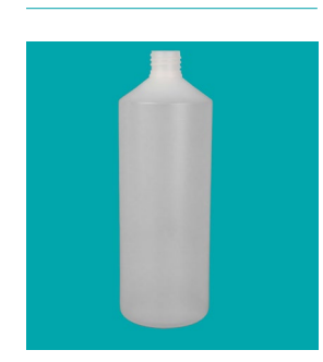
1000 ml Cylindrical Bottle