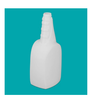
1 litre Trigger Bottle