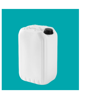
12.5 litre U.N. Jerrycan