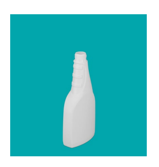
500ml Trigger Bottle