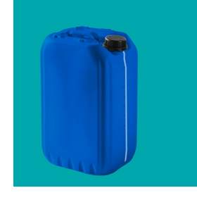
12.5 litre U.N. Jerrycan

Visi-Strip Jerrycans include all the benefits of our