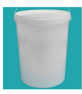
25 litre Bucket with Plastic & T/E Lid

.5g \pm 5\% 570 + 66.3 + 113 = 749.3g ± 5%