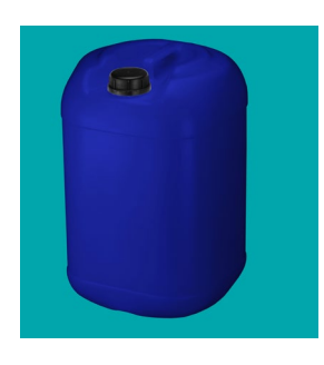
25L U.N. Jerrycan 1050g