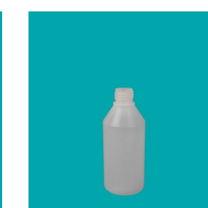
200 ml Cylindrical Bottle