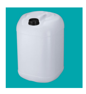
25L U.N. Jerrycan 1300g